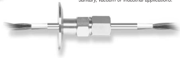
High density gland assemblies can be fitted with KF, CF, SFA and ASME/ANSI style flanges for use in sanitary, vacuum or industrial applications.